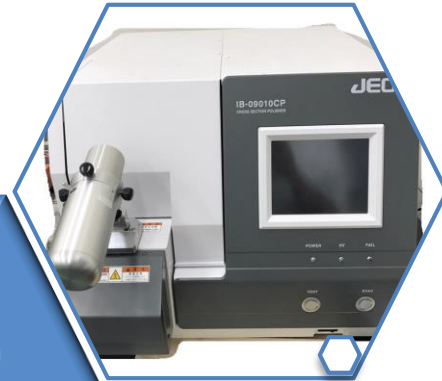
CP (Cross section Polisher) 단면 연마기