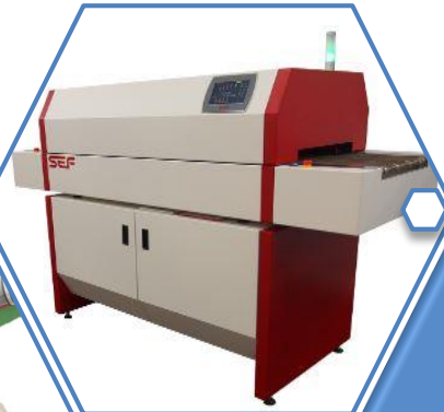
Reflow (Air Convection Reflow) 공기순환식 열풍기