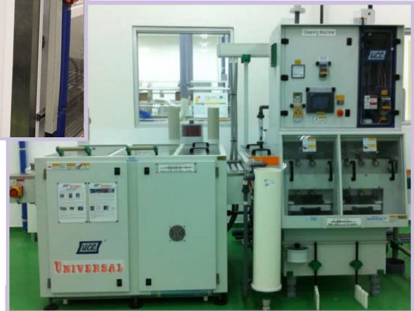
Vertical Rinse Dryer