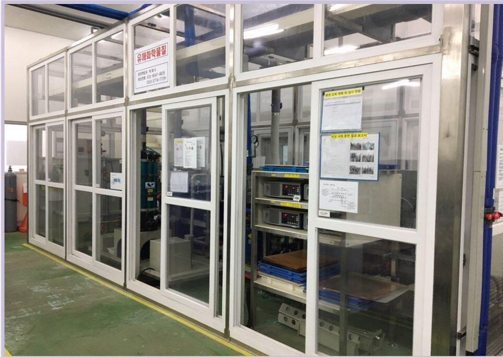
Pilot Line for Electro Cu Plating