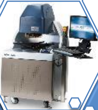
3D scope (3D Optical Microscopy) 3D 현미경