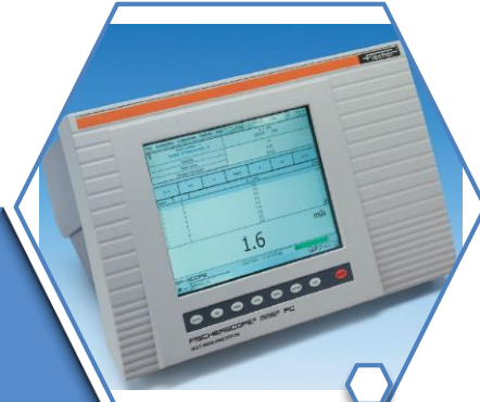
MMS (Multi Measuring System) 전기동 도금두께 측정기