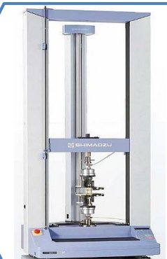
UTM (Universal Testing Machine) 만능재료시험기