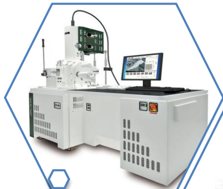
FE-SEM (Field Emission Scanning Electron Microscope) 전계방출형 주사 전자 현미경