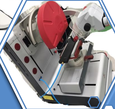
Pull & Shear Tester